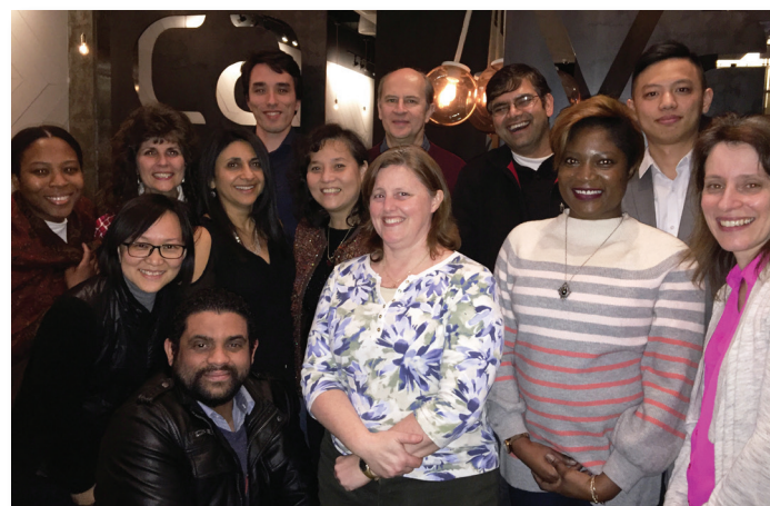
Members of the UMB ABCD team:

Earlier this year, UMB was featured in an article about the ABCD Study in Science Magazine. ( http://www.sciencemag.org/news/2018/01/huge-study-teen-brains-could-reveal-roots-mental-illness-impacts-drug-abuse ). We are so grateful to our ABCD families for their enthusiastic support of brain science and the UMB ABCD Site!