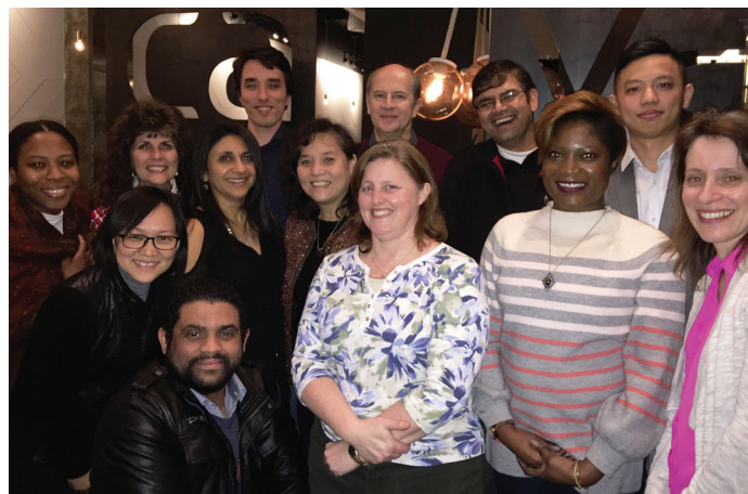
Members of the UMB ABCD team:

Earlier this year, UMB was featured in an article about the ABCD Study in Science Magazine ( http://www.sciencemag.org/news/2018/01/huge-study-teen-brains-could-reveal-roots-mental-illness-impacts-drug-abuse ). We are so grateful to our ABCD families for their enthusiastic support of brain science and the UMB ABCD Site!